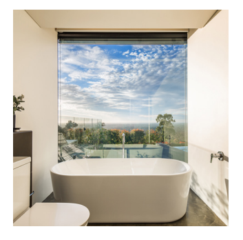
Architect: Marco Spinelli, Architects Ink